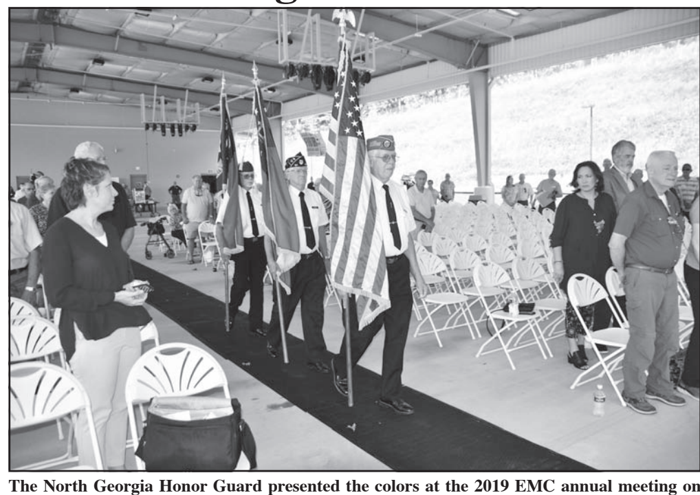
Thursday, Sept. 26.

registered members attending the same amount of money the 2019 outing.